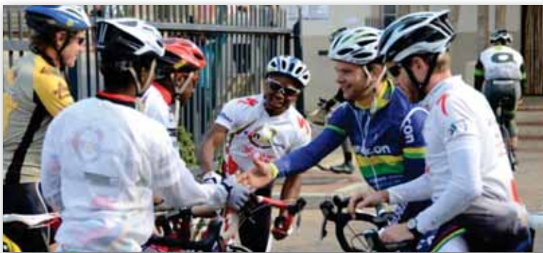
Aurecon staff cycling with a group of children in Cape Town

development projects, the group instituted Aurecon Cares initiatives. During the 2010/2011 FY, Aurecon contributed more than R1.6 million in donations and employees' time to Aurecon Cares.