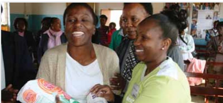
CSI Initiative Hospice

...our involvement with Songo.Info has involved both financial support of this charity as well as the mentoring of young riders on road cycling skills, etiquette, nutrition and assistance with planning their future in road cycling.