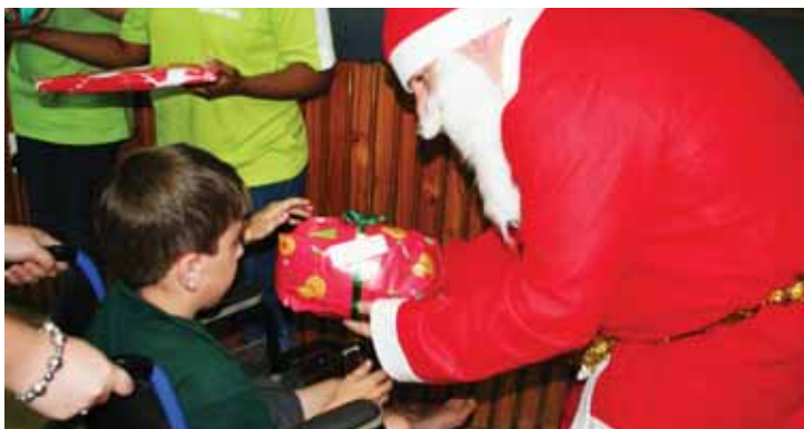
New Hope School

... hosting a fun-filled sports day for children from a disadvantaged community. The children were treated to fun and games, organised by Aurecon staff.