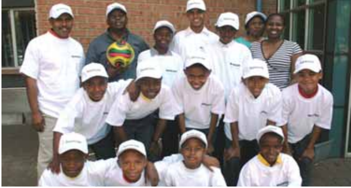
Soccer handover at Aurecon Tshwane office