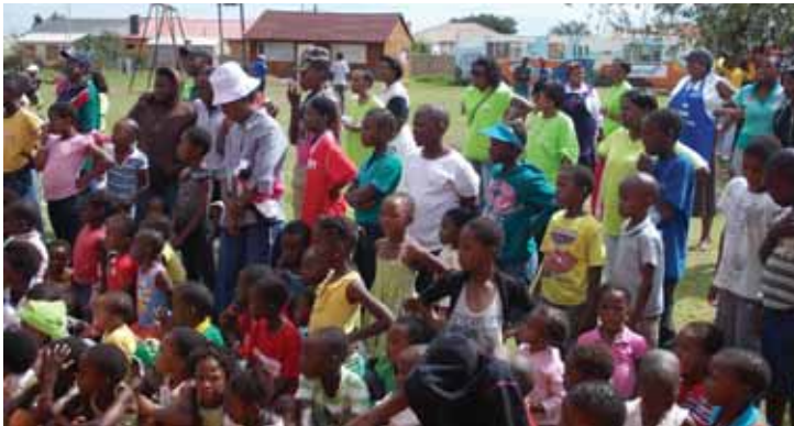
Thusanang Children's Home

...donating branded T-shirts and hats to an underprivileged u/14 soccer team. Proud of their new 'uniform', the Aurecon outfits were sported by the team on a trip to South America.